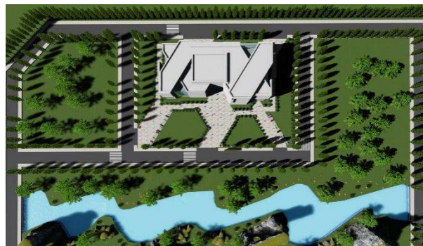
Figure 4. Planning layout analysis

formed, namely the protection area of the old ruins, the outdoor landscape layout area of the new building and the main display and visiting area of the new building; Thus highlighting the important position and historical significance of the revolutionary history of the Left Power War of Resistance. In the planning of the outdoor landscape of the building, it is mainly the use of soft and hard combination, in the greening: tree species mainly use poplars, pine trees and other local common and suitable varieties for growth, the use of local original ecological plants on the shrubs, eliminating the cumbersome process of replanting, the same is true for green space, such a technique makes the architectural landscape and the surrounding landscape blend, in the hard: divided into driving routes and pedestrian flow lines, the road width is 10 meters and 7 meters, the space is very sufficient, in line with the driving specifications of the exhibition hall, there is a large area of vehicle parking spaces, In line with the driving and parking specifications of the exhibition hall, the visiting streamline of the crowd is connected in one breath, and after moving forward, it conforms to the circulation norms of the crowd in the exhibition hall. (Figure 4).