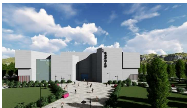
Figure 3. Design sketch

mainly combined with local customs and folklore, warrior spirit, and modern science and technology to create a strong visual impact effect, give visitors a good visual experience effect, restore the fierceness of the war, the indomitability of the soldiers, the greatness of the motherland, and at the same time carry forward China's red culture and cultural spirit. (Figure 3).